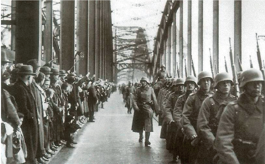
A photograph of German forces crossing the Cologne Bridge to enter the Rhineland in 1936.