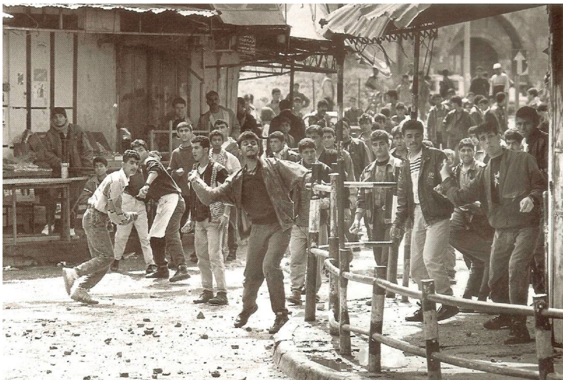
A photograph of young Palestinians throwing stones at Israeli soldiers in Gaza in 1987.

21 Look at the photograph, and then answer the questions which follow.