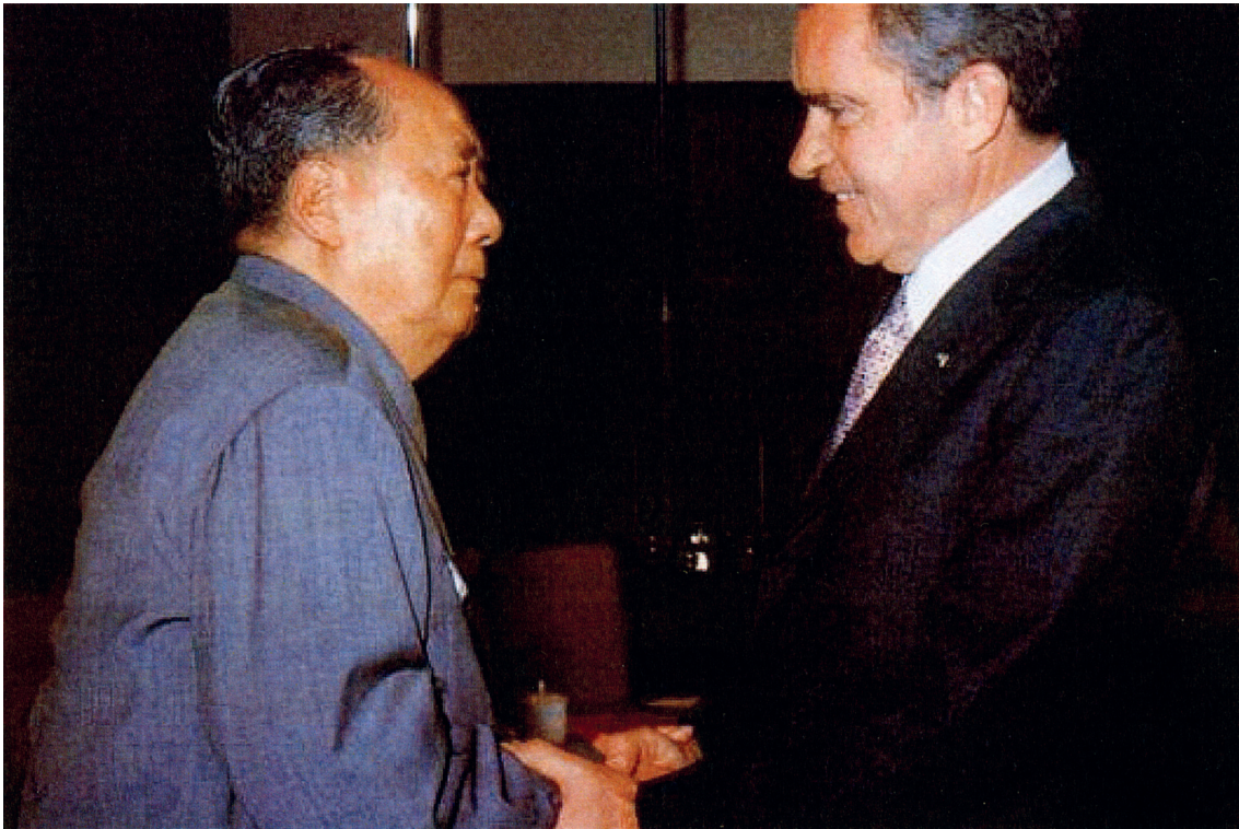
A photograph of Mao meeting with US President Nixon in 1972.

16 Look at the photograph, and then answer the questions which follow.