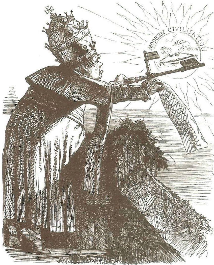
Papal Allocution.—Snuffing out Modern Civilisation.

2 Look at the cartoon, and then answer the questions which follow.