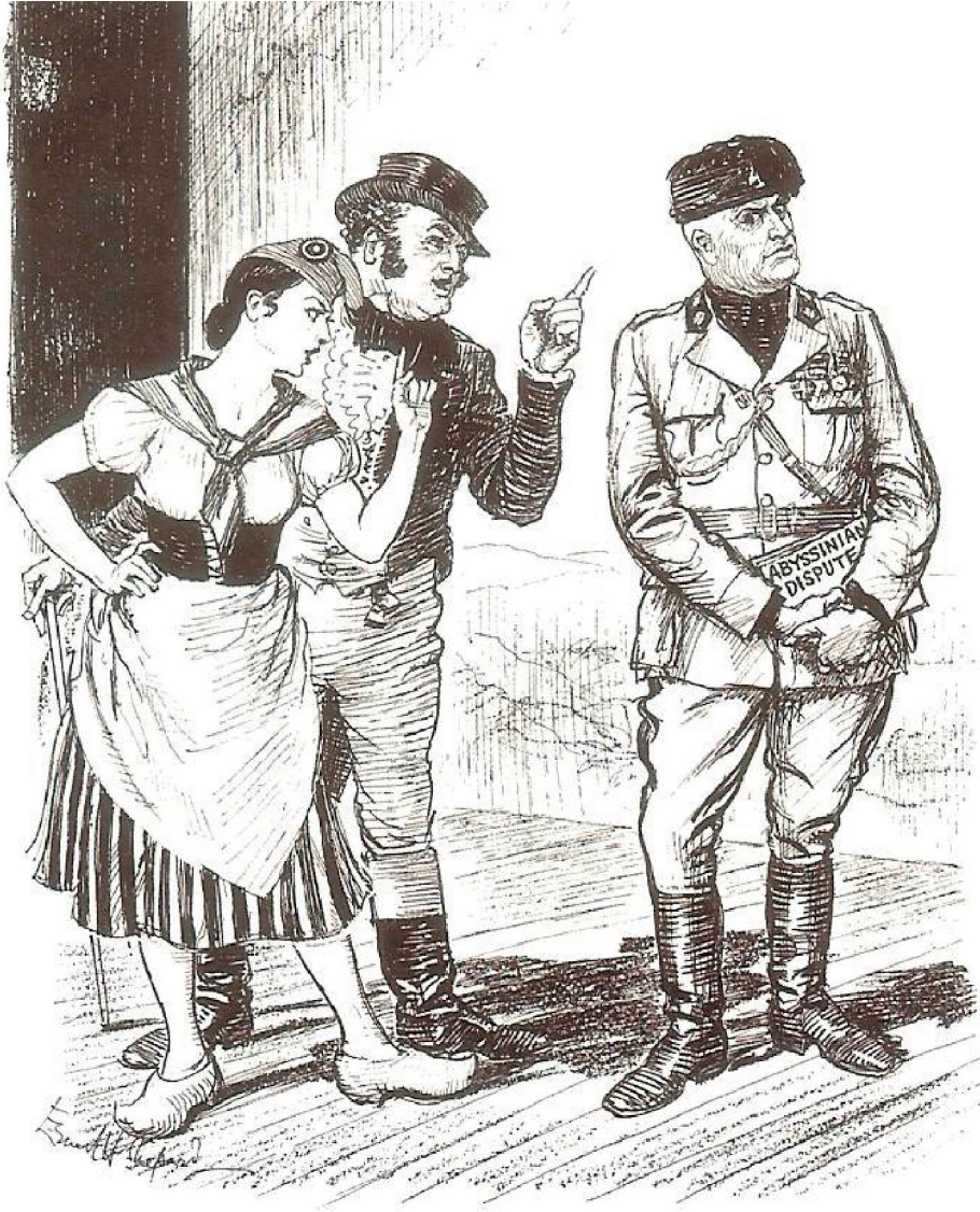
THE AWFUL WARNING.

5 Look at the cartoon, and then answer the questions which follow.